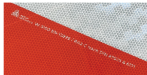
White / Red